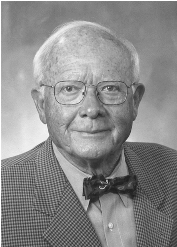
Fig. 1 Photograph of Andrew A. Benson.

illuminated from both sides. After introducing ^{14}\text{CO}_2 , samples of the illuminated Scenedesmus suspension were removed after short exposure times and collected in hot methanol, thereby stopping all enzymatic carbon reactions. The samples were then analyzed by two-dimensional paper chromatography using solvents that had been developed for clear separation of the ^{14}\text{C} -labeled metabolites formed in the experiment. The labeled compounds were localized on the chromatograms and identified by autoradiography. These techniques, introduced by Benson to the Calvin group, subsequently became the gold standard for ^{14}\text{C} -labeling experiments by laboratories worldwide. Figure 2 shows Benson with a radiochromatogram.