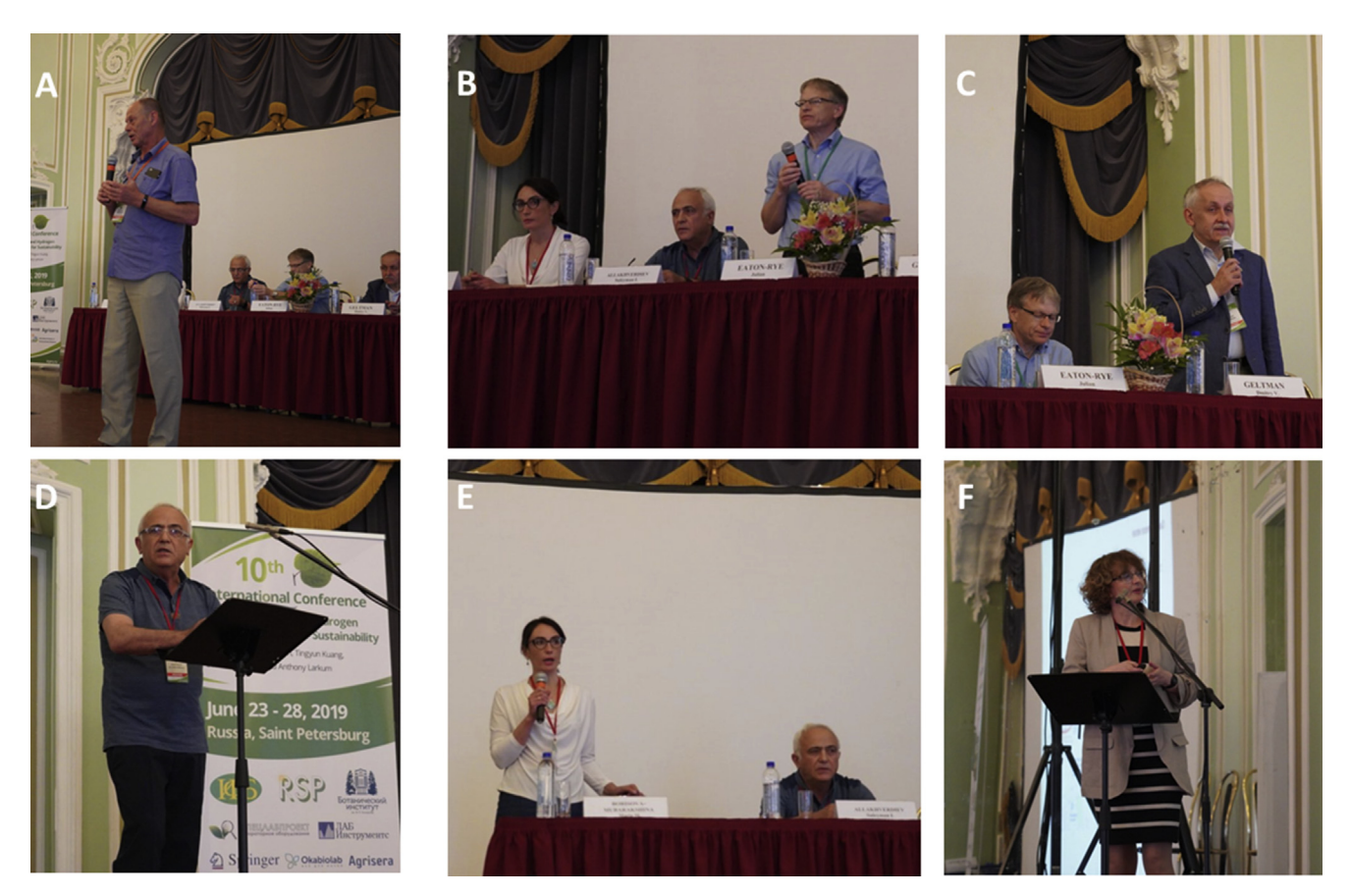
Fig. 1 – Photographs from the opening ceremony of the 10th International Conference «Photosynthesis and Hydrogen Energy Research for Sustainability–2019» A – Anatoly Tsygankov; B – Julian Eaton-Rye; C – Dmitry Geltman; D – Suleyman Allakhverdiev, E – Maria Borisova-Mubarakshina; F – Olga Voitsekhovskaja.

Trapping in Photosystems; (6) Plant Development and Growth Regulation; (7) Carbon Fixation (C3 and C4) and Photorespiration; (8) Artificial and Applied aspects of Photosynthesis including Nanotechnology; (9) Regulation of Photosynthesis, ROS (Reactive Oxygen Species) production and Environmental Stress; (10) Systems Biology of Photosynthesis: Integration of Genomic, Proteomic, Metabolomic and Bioinformatic Studies; (11) Plant Mineral Nutrients and Photosynthetic Capacity; and (12) Photosynthesis Education and Emerging Techniques for Studying Photosynthesis including Neutron Scattering.